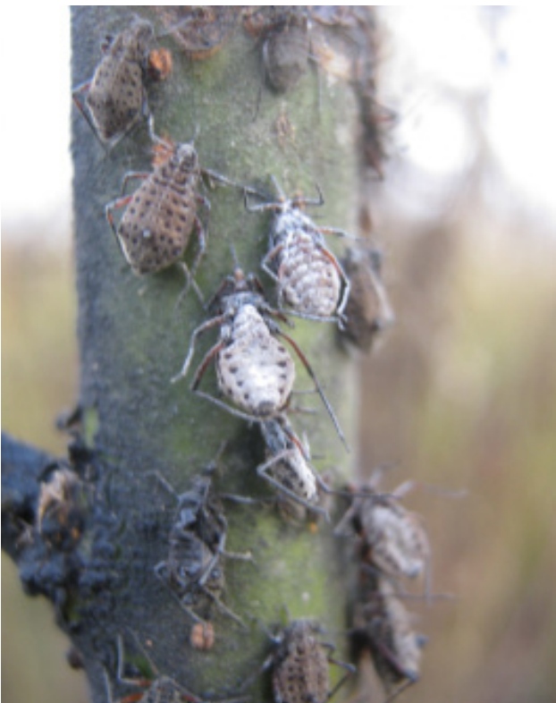
Figure 4. Giant willow aphids probably infected with Neozygites turbinatus (R.G. Kenneth) Remaud. & S. Keller.