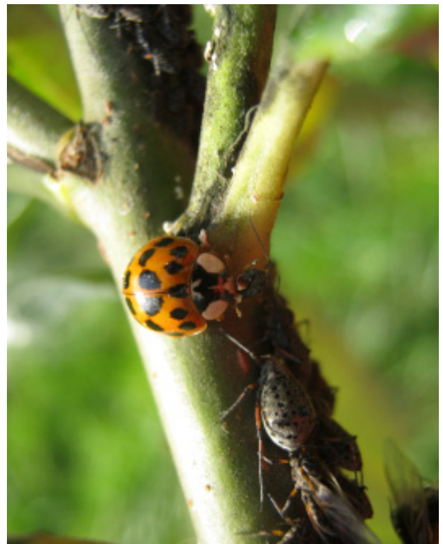
Figure 5. Harmonia axyridis (Pallas) ladybird feeding in giant willow aphid colony.