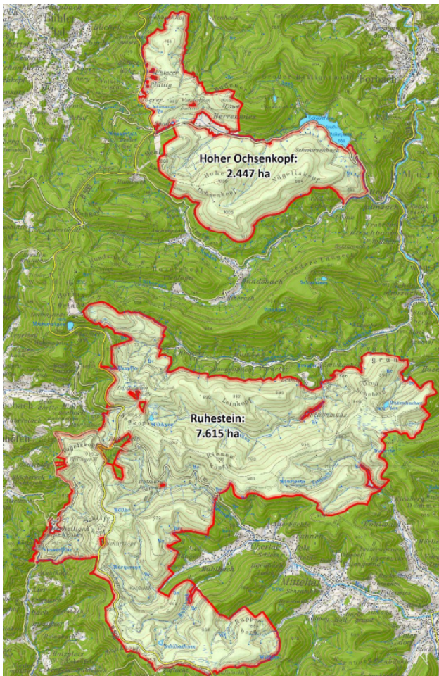
Figure 2. Nationalpark Schwarzwald

In 2014, a study (telephone interviews using a questionnaire) was conducted on perceptions of the Black Forest National Park (Blinkert, 2015). A randomly selected 1,000 people from Baden-Württemberg and 500 people from municipalities in the park area took part in the survey. The results indicated that the interest of Baden-Württemberg's citizens in the park was high (60%), and even higher among regional residents (70%). Nearly 63% of the people surveyed in Baden-Württemberg viewed the creation of the park positively, while 7% had the opposite opinion. In the villages in the park area, the assessment was lower (50% positive and 14% negative). Respondents identified advantages and disadvantages associated with a national park (Blinkert, 2015). Among the advantages, the following were mentioned: protection of nature (almost 3/4 of the respondents), increase in tourism (2/3 of the respondents),